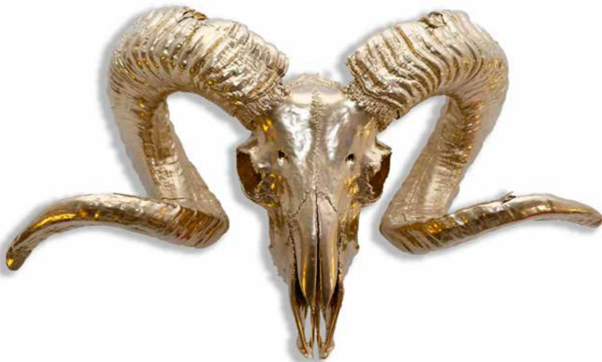
Right: Gold Curly-Horned Ram Skull with Gold Pigment and Resin 20 x 12 x 8 inches | £1,695