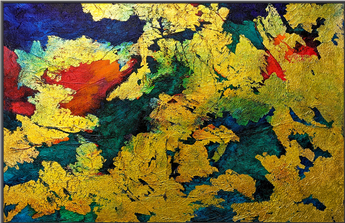
Kimono | Original Acrylic and Gilding on Canvas | 105 x 68 cm | £2,395