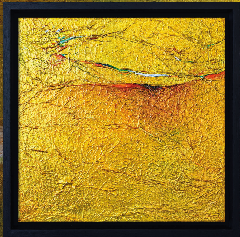
Smile | Original Acrylic and Gilding on Canvas | 34 x 34 cm | £495

The result is a series of complex gilt pictures.