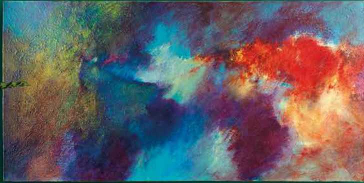
Vista | 39 x 20 Inches | £1,295