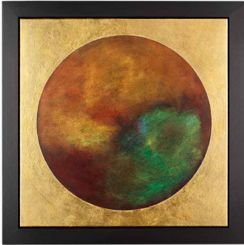
Regency | 24 x 24 Inches | £895