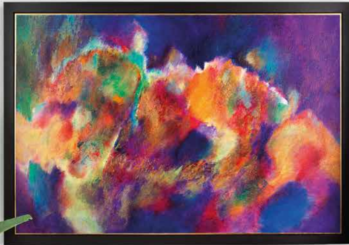
Dominion | 47 x 39 Inches | £3,795