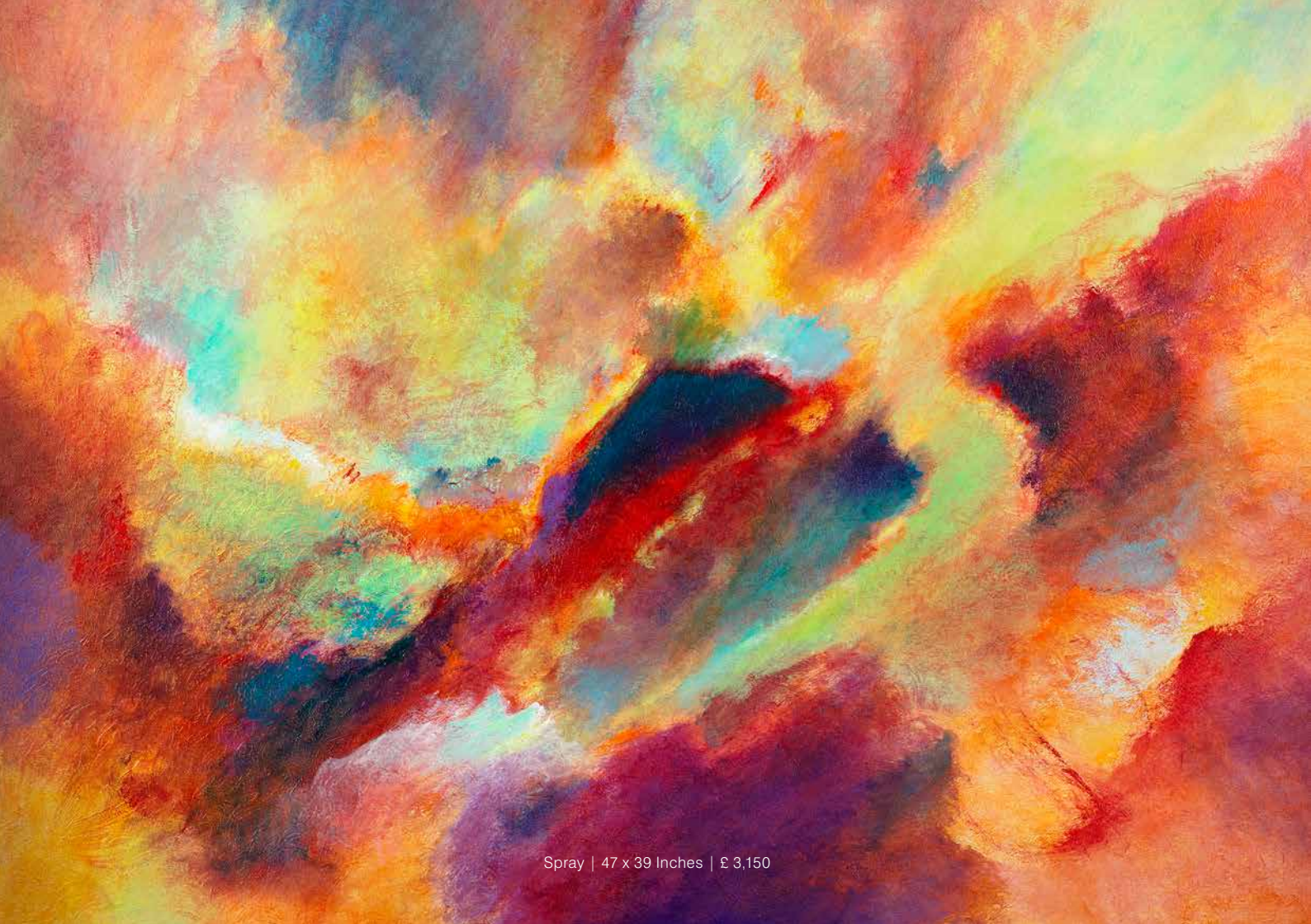
Spray | 47 x 39 Inches | £ 3,150