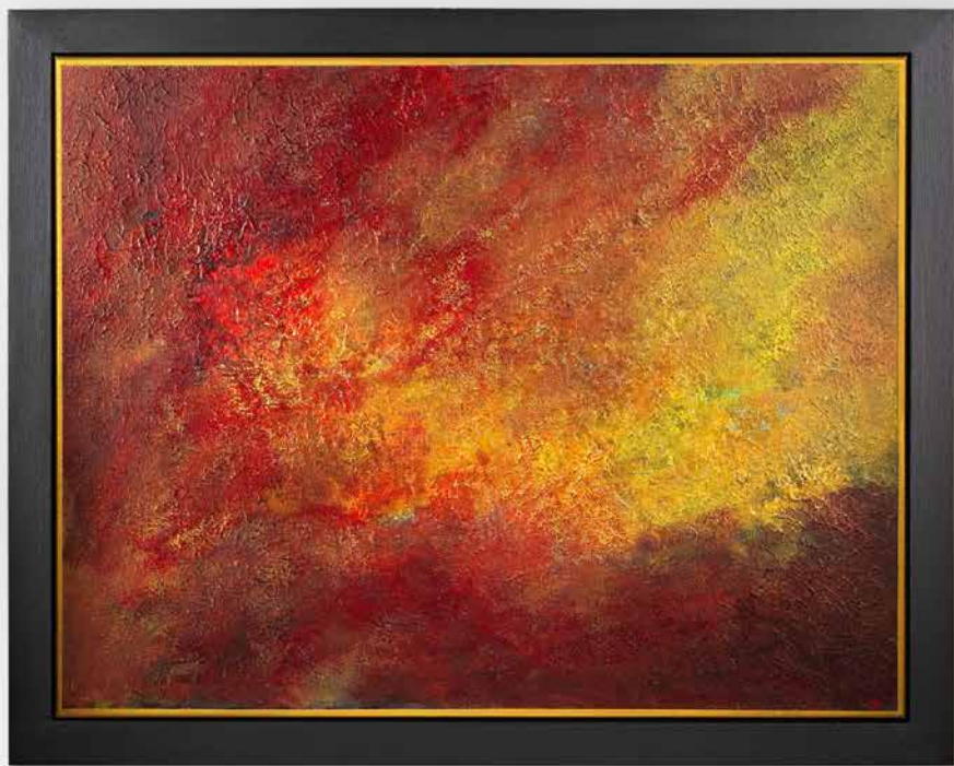
Warmth | 35.5 x 27.5 inches | £ 1,595