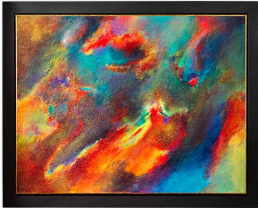
Eruption | 35.5 x 27.5 inches | £1,595